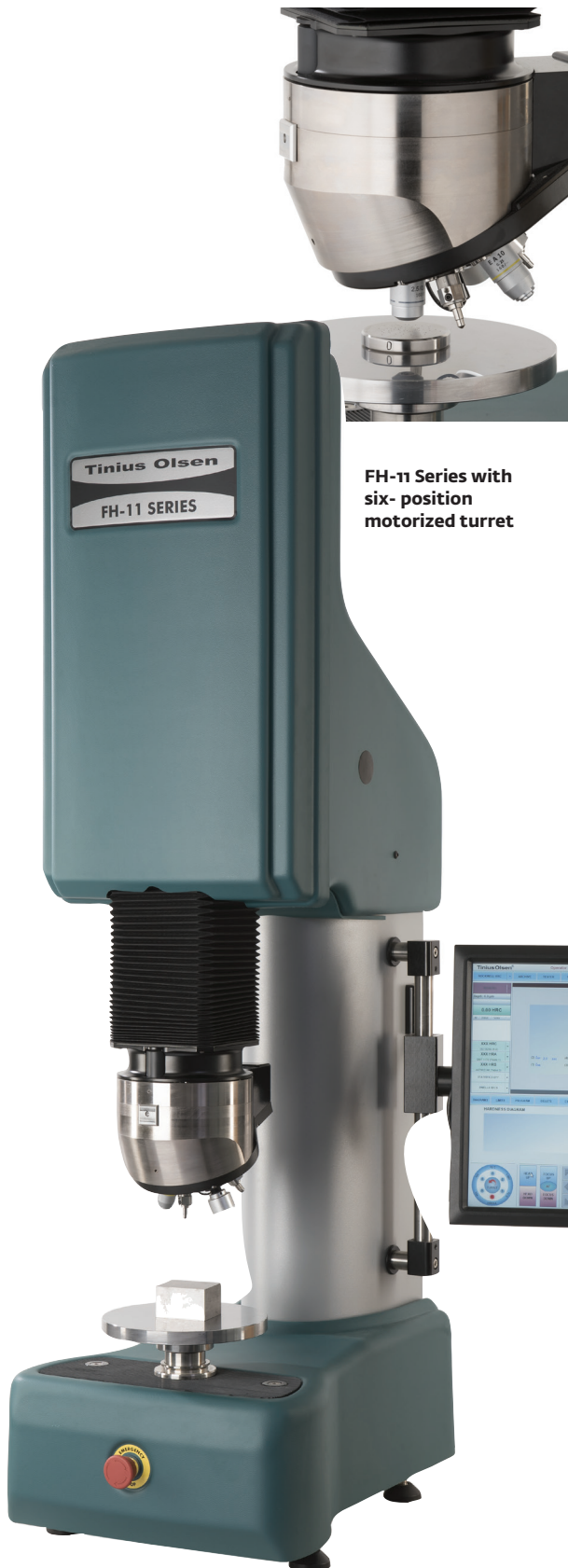
FH-11 Series with six-position motorized turret