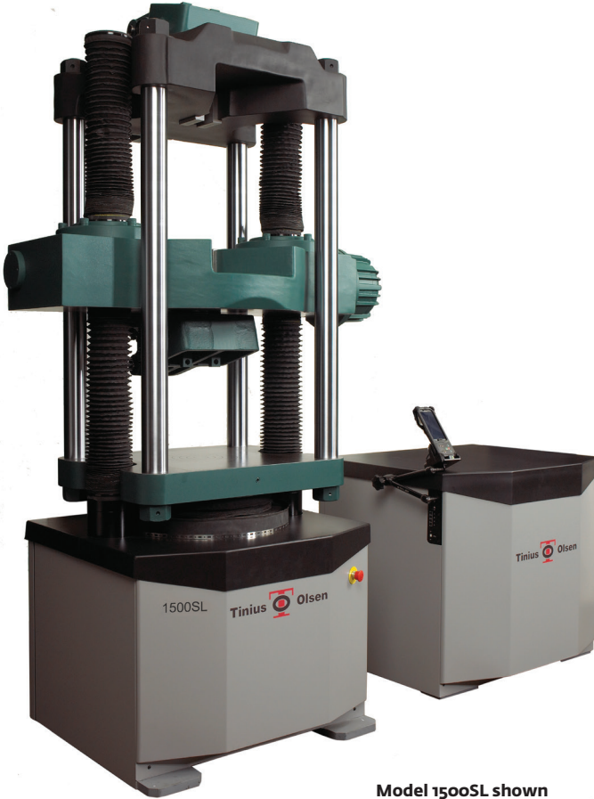
Model 1500SL shown