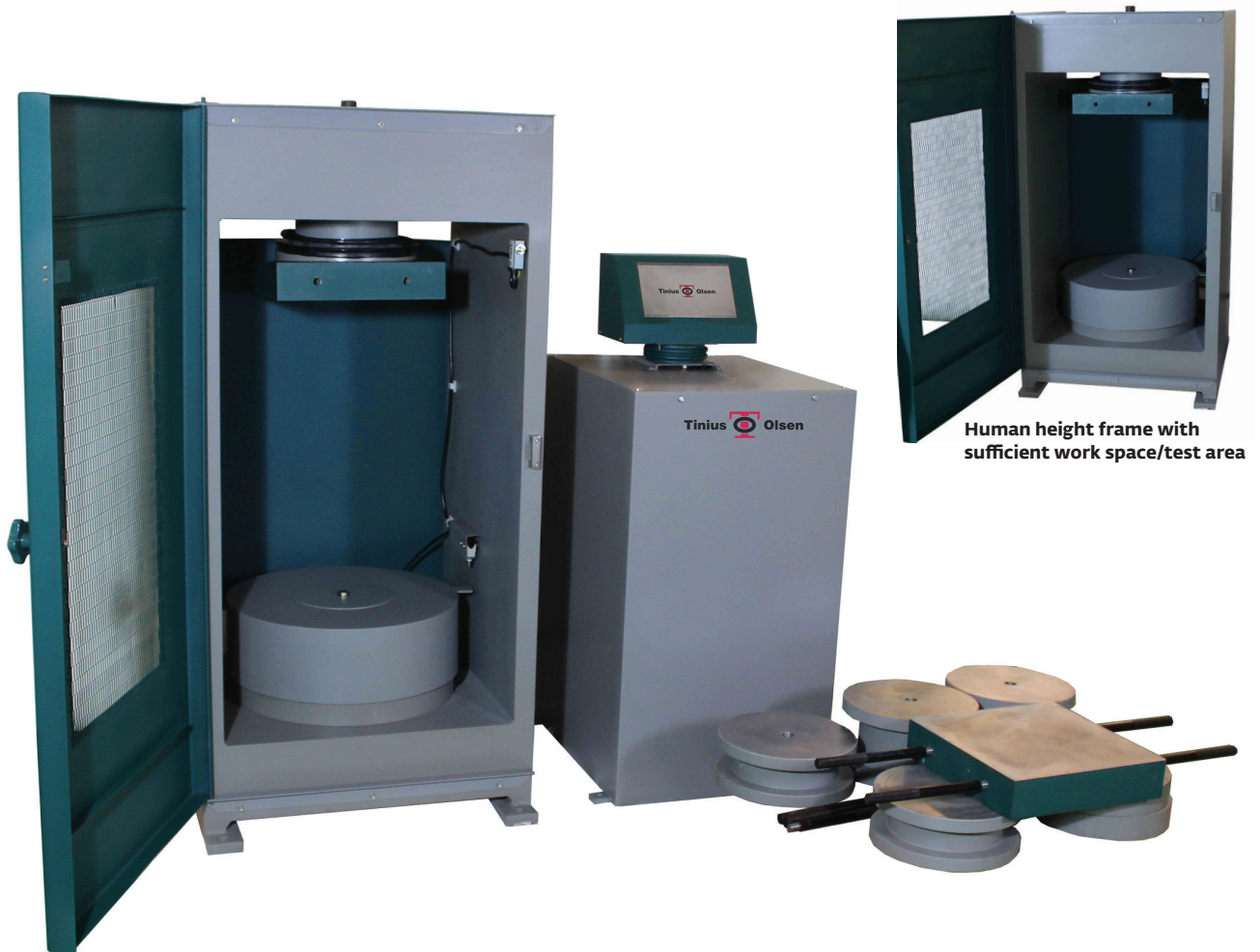
Human height frame with sufficient work space/test area

The TO-320E-FA-CT-5000-ET Automatic Concrete Compression Testing Machine has been designed to meet the need for a simple, economic and reliable method of testing the compressive strength of concrete.