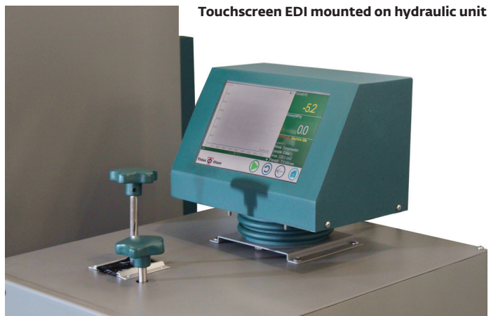
Touchscreen EDI mounted on hydraulic unit